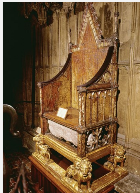
Coronation Chair: Made in 1301 for Edward I

You have demonstrated the values that most decent people also value - as did those young Scots all those years ago. And for this we appreciate you.